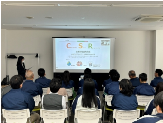
Education on responsible procurement for procurement personnel

Responsible Procurement Guidelines ( https://www.gs-yuasa.com/en/csr/pdf/Responsible_Proc_Guide_190326.pdf ).