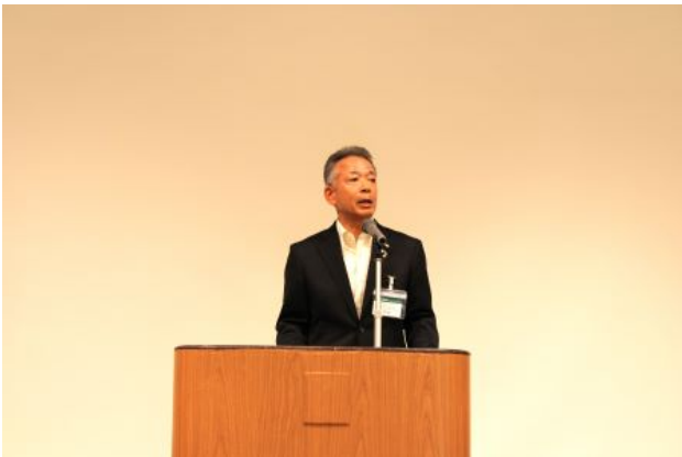
Procurement policy briefing for suppliers

In fiscal 2025, we are undertaking procurement activities with a focus on two priority initiatives: building robust supply chains by reinforcing QCD (quality, cost, and delivery) and conducting sustainable procurement that meets the needs of society and stakeholders (responses to the SDGs, carbon neutrality, and cyber security).