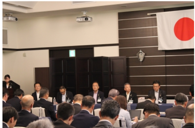
Procurement policy briefing for suppliers